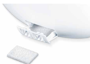
For use with aroma oils (incl. 15 aromapads)