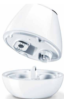
Removable water tank, 2 l