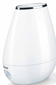
Night mode: Ultra quiet operation and button without illumination