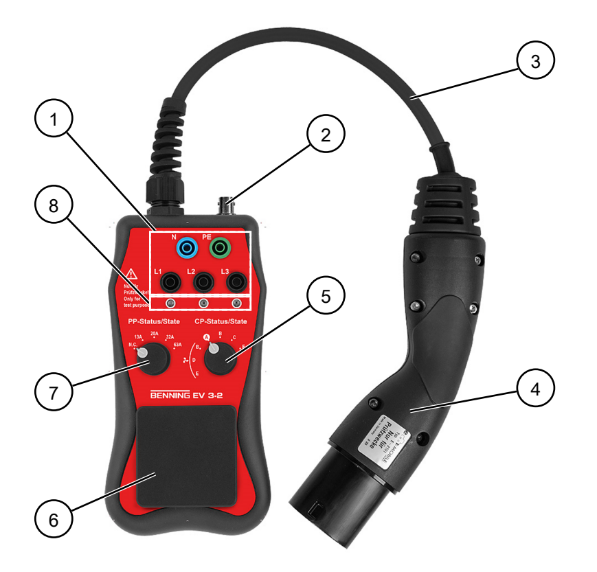
Figure 1: BENNING EV 3-2 device structure