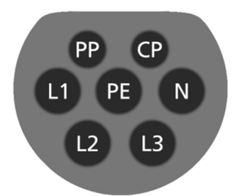
Figure 2: Assignment of the Type 2 connector for connection to the charging station (EVSE)